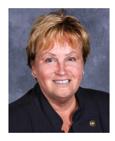
"Share our similarities, celebrate our differences."